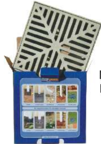
Nylon In the Blue Box