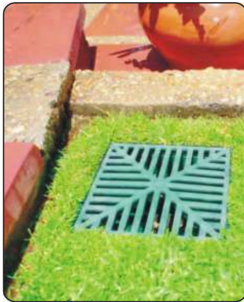
Polypropylene Lite In the OrangeBox